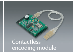
Contactless encoding module