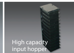
High capacity input hopper