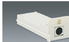
Contact Smart IC chip encoding module